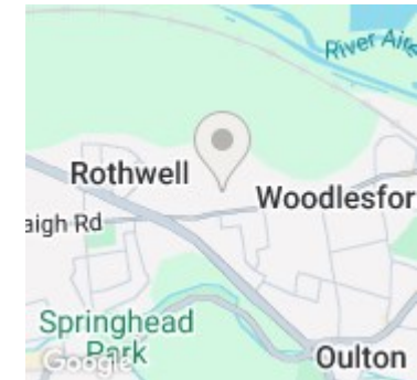
Illustration for identification purposes only, measurements are approximate and not to scale, unauthorised reproduction is prohibited.

Approx. Gross Internal Floor Area 1,576 sq. ft / 146.48 sq. m.